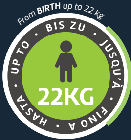
city mini 2 with carrycot