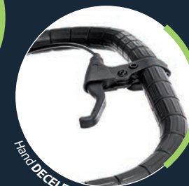
Hand DECELERATION Brake