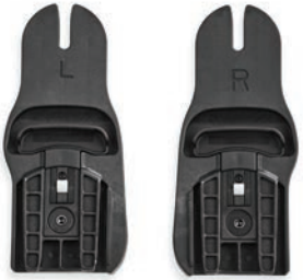
car seat adapters